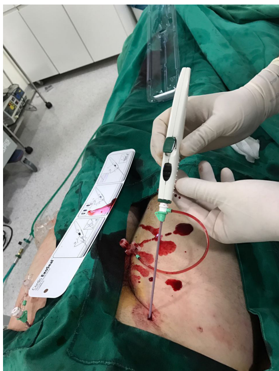
Figure 3. Proper positioning of the device.

In order to test for differences in skin-artery depth before and after the procedure and with and without the device, the Shapiro-Wilk test was used to verify the normality of the variable “skin-artery depth” before the surgical procedure (Table 2). Data were only normally distributed for the group in which the device was not used: depth before ( p=0.0200 ) and depth after ( p=0.0407 ). In the group in which the device was used, data were not normal: depth before ( p=0.9017 ) and depth after ( p=0.3392 ). In view of this, the results for both groups were compared using the Wilcoxon test (Table 3) to determine whether there were significant difference between baseline thickness (before the procedure) for patients allocated to each group (with and without device). The objective of this test was to test whether the sample of patients was