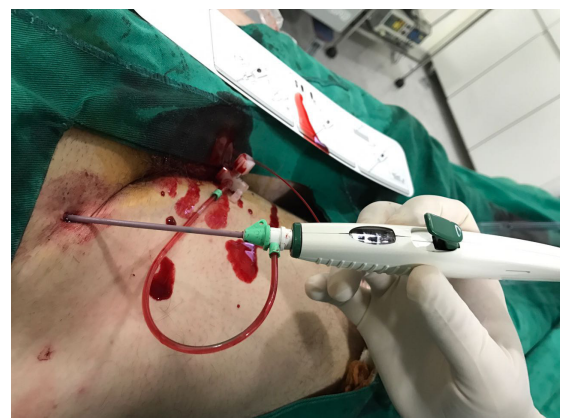
Figure 2. Insertion of device in the introducer.