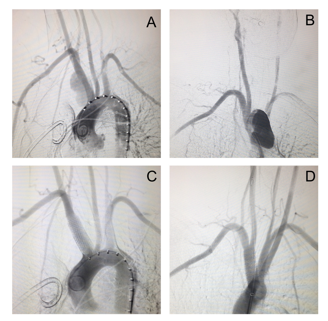
Figure 2. Images of endovascular treatment to repair an aneurysm of the brachiocephalic trunk with covered stents. Initial arteriography (A, B); Final arteriography (C, D).