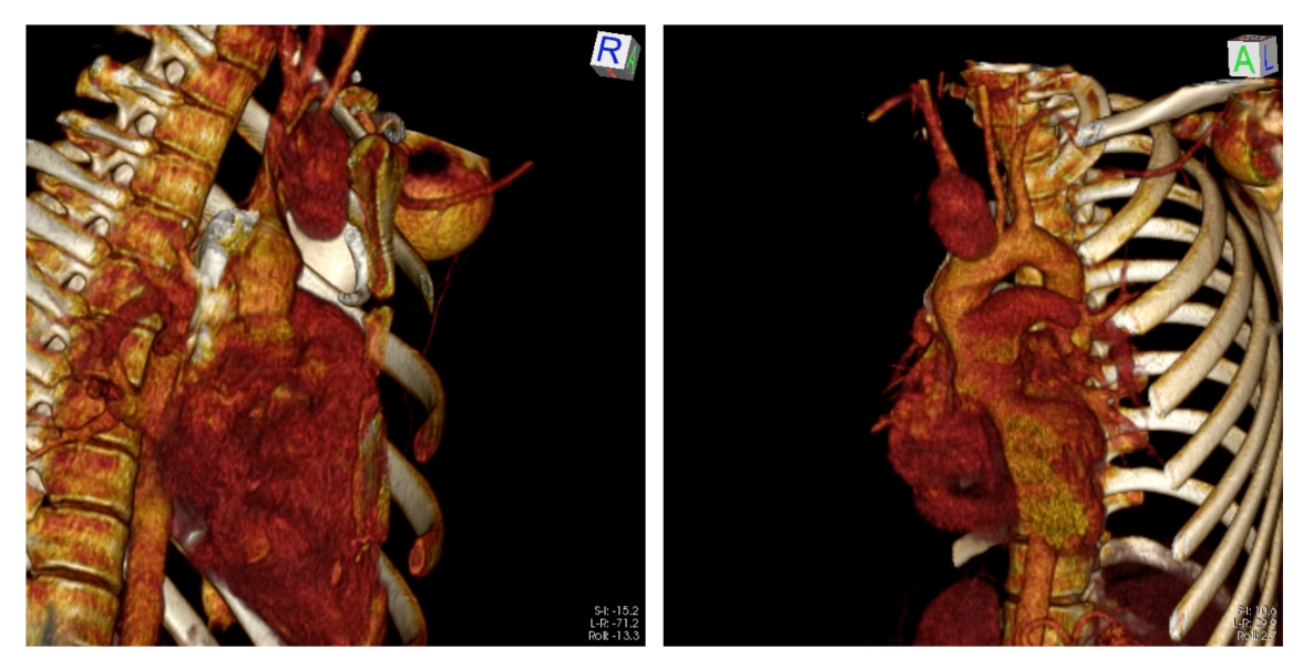
Figure 1. Reconstructed angiotomography images showing an aneurysm of the brachiocephalic trunk.