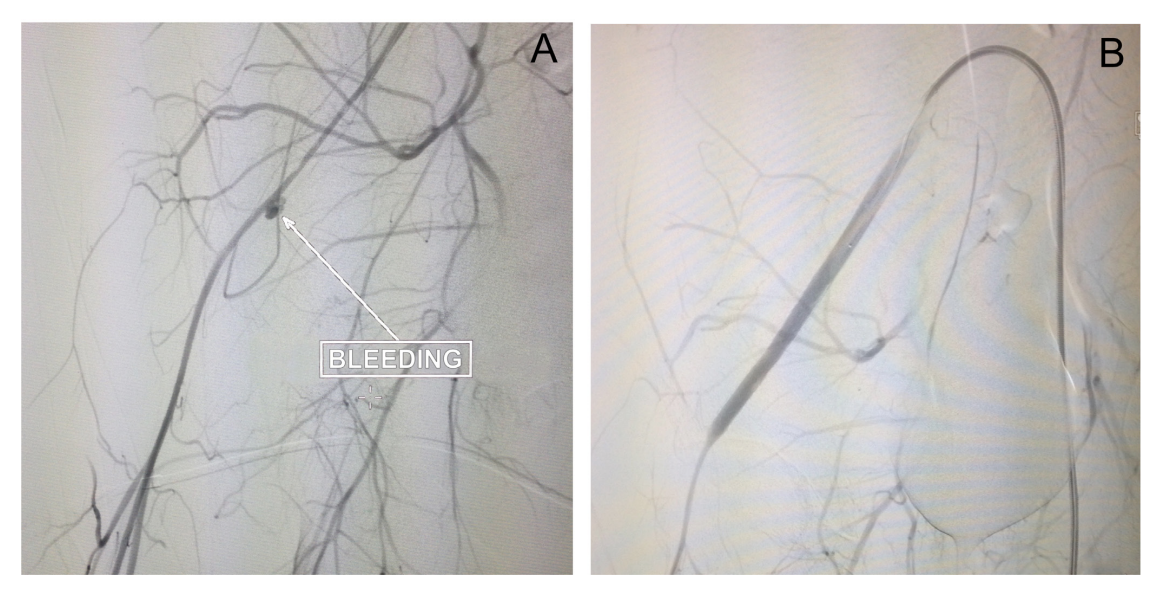
Figure 3. Images of endovascular treatment of hemorrhaging aneurysm at the puncture site using a covered stent. Initial arteriography (A); Final arteriography (B).

he had been in outpatients follow-up for 3 months and was asymptomatic, and a control tomography showed good results (Figure 4).