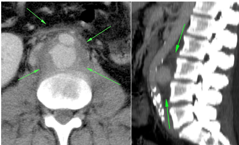
Figure 1. Computed tomography showing an abdominal aortic aneurysm with signs suggestive of infection.

The patient was transferred to the intensive care unit (ICU), where he remained for 8 days. After 3 days he