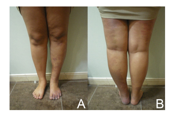
Figure 2. Disproportion between the second patient's lower limbs. (A) anterior view; (B) posterior view.

Figure 1. Verrucous nevi, lymphedema, venous angiodysplasia and angiokeratoma can be seen on the right lower foot.