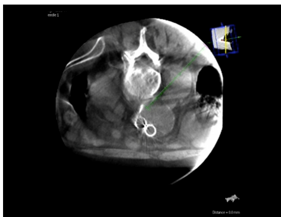
Figure 3. Embolization of type II endoleak via translumbar access. Calculating trajectory with three-dimensional computed tomography in real time. The ideal trajectory of the needle is determined by the vascular surgeon marking the endoleak as the target and taking care to avoid vital anatomic structures.

be reached by catheterization of the IIA or the SMA. 1 Translumbar embolization is a form of minimally invasive treatment, with short procedure time and limited use of contrast mediums, and is an alternative option that is particularly useful when transarterial access is impossible (Figure 3). 1,15