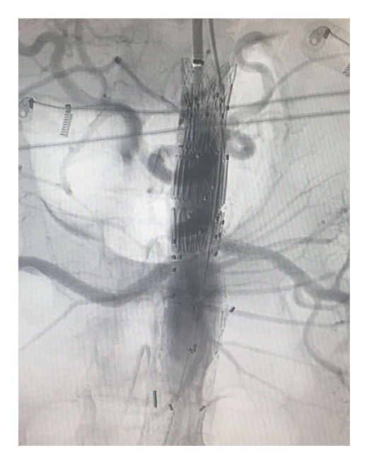
Figure 2. Control angiography after deployment of the second endoprosthesis and the covered stents.

rheumatology team and was put on corticoid therapy DISCUSSION at immunosuppressant doses in combination with cyclophosphamide. He has been in follow-up for more than 12 months and no further complications have been detected, as shown by control reconstruction tomography (Figure 3).