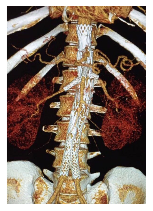
Figure 3. Three-dimensional reconstruction of control angiotomography at 6-month follow-up.

Behçet's disease is characterized by chronic systemic vasculitis involving the mucocutaneous, occular, articular, neurological, cardiovascular, gastrointestinal, and respiratory systems.<sup>2,7,12,13</sup> It most often occurs in young male adults between the third and fourth decades of life.<sup>2,6,9,14</sup> The case described here fits the most common epidemiological profile found in the literature. It is now recognized that the vascular injuries of BD are more common among male patients.<sup>10,13</sup>