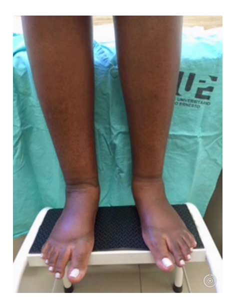
Figure 1. Lymphedema of lower limbs, more severe on the right.