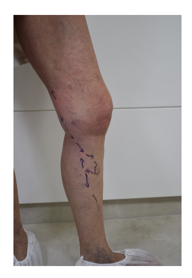
Figure 1. Hemodynamic schema. Reflux in the saphenous vein distal to a collateral at the thigh, transferred to a leg collateral. The same collateral then transfers reflux back to the saphenous vein a few centimeters distally.

phlebectomies and neither procedure involved treatment of the saphenous veins (our Duplex ultrasound was equal to an exam prior to the previous operation). The hemodynamic evaluation identified a 3 mm collateral at the mid-thigh transferring reflux to the 5.8 mm great saphenous vein, which presented reflux from this point to the upper leg. Distally, the saphenous vein was transferring reflux to a 3.5 mm tributary, from which point it resumed upward flow for a few centimeters, until the same collateral transferred reflux to the GSV again. We present the pre-treatment hemodynamics of this case in Figure 1 and post-treatment in Figure 2. We proposed fractionation