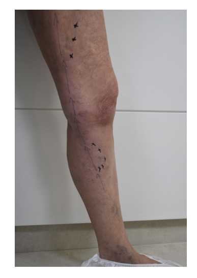
Figure 2. Hemodynamic schema. The saphenous vein no longer has reflux and the collaterals involved are occluded. Observe that the veins at the ankle have regressed without direct treatment.

Figure 1. Hemodynamic schema. Reflux in the saphenous vein distal to a collateral at the thigh, transferred to a leg collateral. The same collateral then transfers reflux back to the saphenous vein a few centimeters distally.