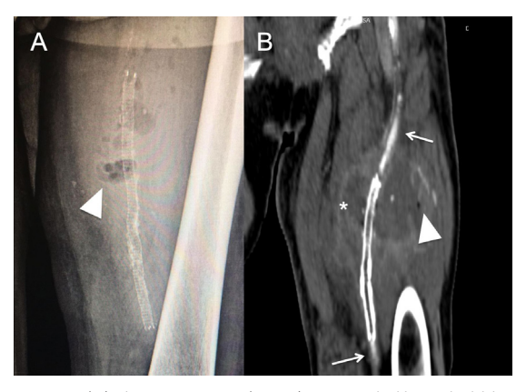
Figure 1. (A) Plain X-ray, stent (arrow) surrounded by air bubbles (arrowhead); (B) Angio CT reconstruction, thrombosed stent (arrow), and large pseudoaneurysm (asterisk).