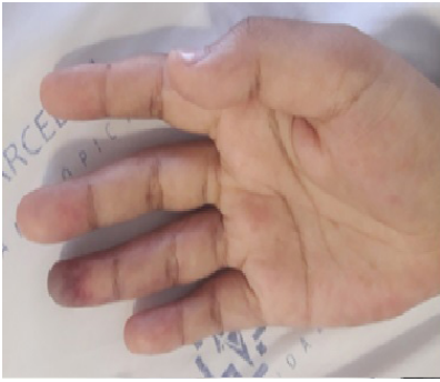
Figure 1. Cyanosis of the fourth finger of the right hand.