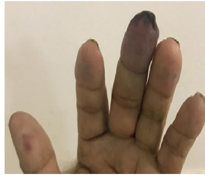
Figure 5. Non-blanching cyanosis of the third finger of the left hand.

The patient's condition became critical and, on the 10th day after admission to the intensive care unit (ICU), she exhibited non-blanching cyanosis involving the right hand only, with pulses still present (Figure 8). She was put on a full anticoagulation protocol with unfractionated heparin, which contained the ischemia. However, the patient died from infectious and pulmonary complications after 42 days in hospital.