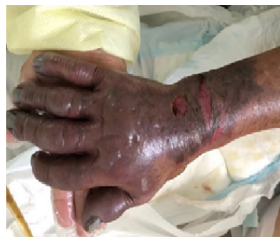
Figure 8. Right hand with non-blanching cyanosis, blistering, and distal pulses present.