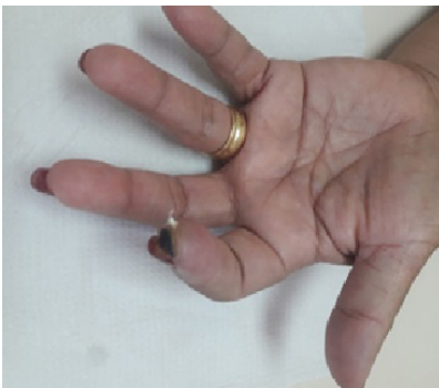
Figure 4. Dry necrosis, delimited, second finger of the right hand after 14 days.

of cyanosis, and resolution of the temperature gradient and was discharged from hospital on the 14th day after admission (Figure 2).