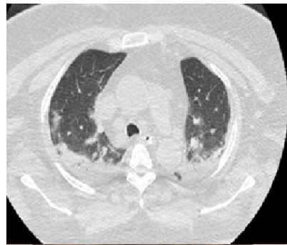
Figure 6. Axial computed tomography image of the chest, showing bilateral ground glass signs.