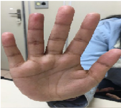
Figure 2. Fourth finger of the right hand after 14 days.