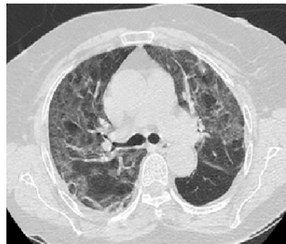
Figure 7. Axial computed tomography image of the chest, showing bilateral ground glass signs.