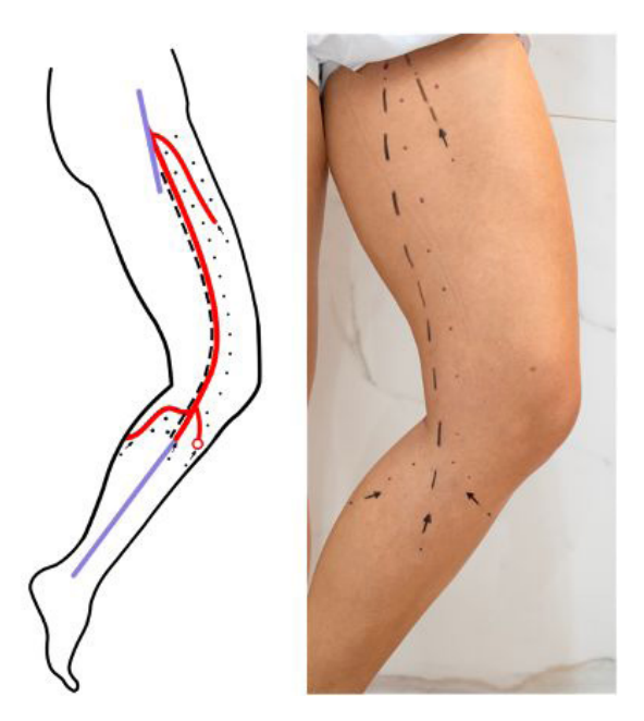
Figure 1. Detailed marking on the medial aspect of the left lower limb. (A) Phlebogram illustrating the ostial reflux in the internal saphenous and anterior accessory saphenous veins, transmitted to the anterior and posterior arcuate veins; (B) Standardized symbols suggested for planning the procedure.

When there are indications to treat both axial and tributary veins in the same procedure, a logical sequence is essential to avoid vasoconstriction of the