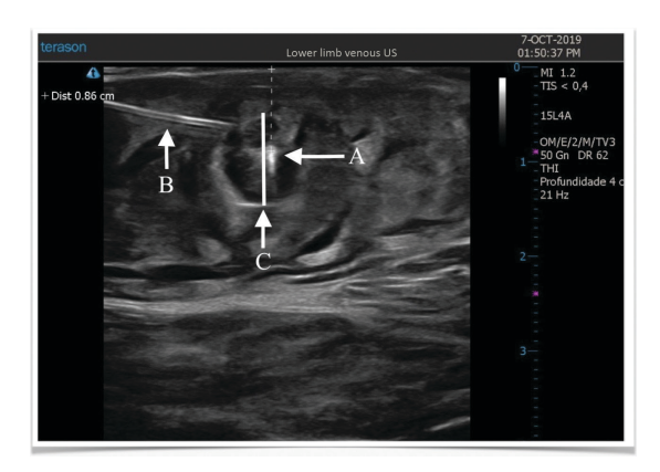
Figure 4. Ultrasonographic images acquired during tumescent anesthesia. Observe in the image: (A) the endolaser fiber; (B) the tumescent anesthesia needle; and (C) the tumescence halo, confirming the distance from the anterior vein wall to the skin.

Endovenous laser equipment can delivery light energy in pulsed or continuous mode. The continuous mode offers easier quantification of the total energy delivered per vein segment treated, or by surface, and is the mode chosen for the ATTA method. Power delivery ranges from 1 to 40 watts (W), depending on the manufacturer of the unit.<sup>20</sup>