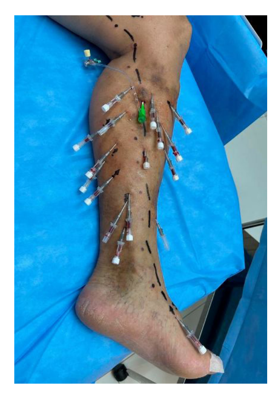
Figure 3. Left lower limb. Observe the use of standardized symbols for the technique. A 6F introducer kit is inserted into the internal saphenous vein and several catheters provide access to the tributary veins.

ensuring the safety of tumescence and thermoablation. The angle between needle and skin during puncture of tributaries are habitually less than 45° and needles are advanced parallel to the skin.