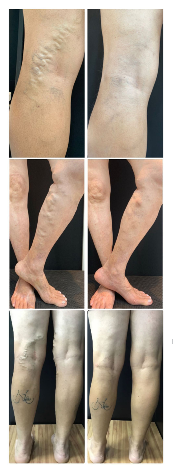
Figure 6. Pre and postoperative photographs of patients treated with the assisted total thermal ablation (ATTA) technique.

Using the methodology described above, the ATTA technique can be applied to other parts of the