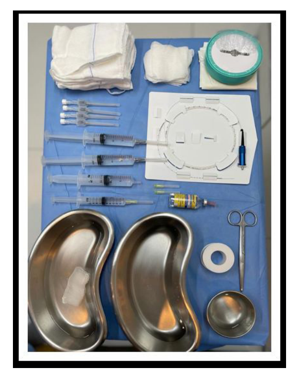
Figure 2. Materials needed for the assisted total thermal ablation (ATTA) technique.