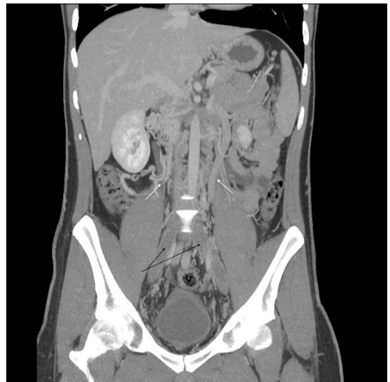
Figure 2. (White arrows) Azygos and hemiazygos system hypertrophy; (black arrows) thrombosed iliac veins.

to a nonfunctional left kidney due to left renal vein thrombosis during childhood and he also had an episode of DVT in the right leg 5 years ago. On physical examination we observe large collateral circulation at the right groin. Blood test shows D-Dimer > 5000 ng/ml. DUS confirms a new episode of DVT with thrombosis from the common femoral to the popliteal vein.