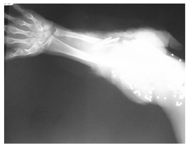
Figure 1 - X-ray of massive bone fracture (gun missiles)

The diagnosis of an upper extremity vascular injury is initially made by physical examination as part of the full trauma assessment. The classic five P's – pain, pulselessness, pallor, paresthesias, and paralysis – may be partially present or may be absent in many patients. Some patients with axillary and proximal brachial artery injuries may have palpable pulses at the wrist. The injury type and location are noted, and the axillary, brachial, radial, and ulnar arteries are palpated for pulsations. Depending on the mode of presentation, most patients were taken immediately