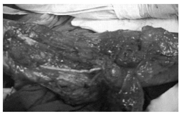
Figure 5 - Crushed brachial artery revascularization (saphenous vein conduit)

An intraoperative angiogram was performed in few cases, whenever distal pulses were absent after the revascularization or assessing injury site or spasm.