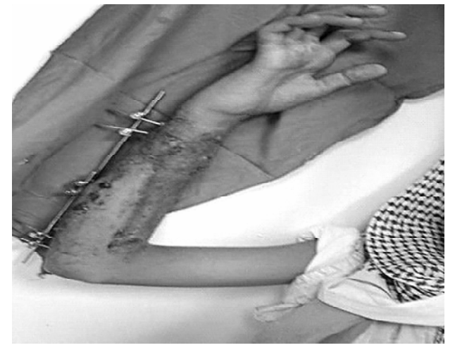
Figure 7 - Delayed primary, split-thickness skin graft