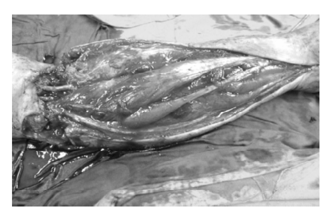
Figure 6 - Fasciotomy after brachial artery repair