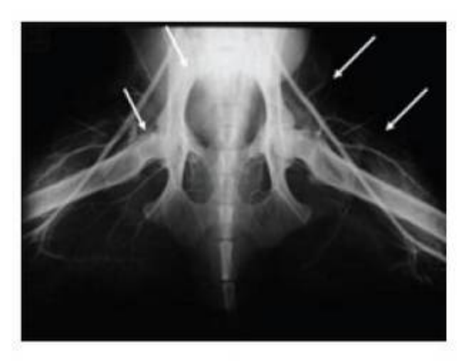
Figure 2 - Arteriography showing patent femoral arteries (arrows showing the site of patches)

Next, the dogs were submitted to laparotomy for exposure and puncture of the abdominal aorta using an 18-gauge Jelco<sup>®</sup>, followed by iodinated-contrast arteriographies (Conray<sup>®</sup>). After arteriography and macroscopic evaluation, all arterial segments having patches were removed for histopathologic tests. The material was stained with hematoxylin-eosin and picrosirius (Figure 2).