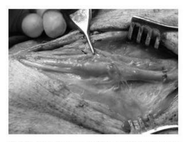
Figure 3 - Femoral artery containing sugarcane membrane patch after 180 days

All animals survived the established period of 180 days for clinical observation and second surgery. There were no cases of infection, dilatation or aneurysm, rupture or pseudoaneurysm and thrombosis in any group (Figure 3).