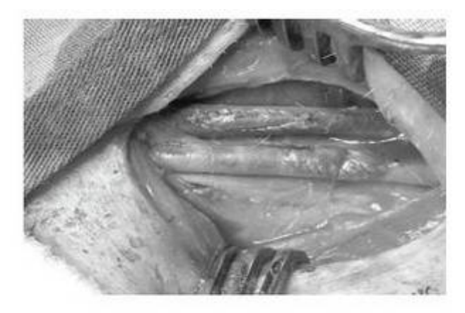
Figure 1 - Femoral angioplasty using sugarcane membrane patch (note that the femoral vein submitted to a sugarcane biopolymer membrane patch was analyzed in another study)

Next, longitudinal arteriotomies were performed by removing an elliptic fragment of the arterial wall measuring 1.5 cm in diameter and a diameter equal to 1/3 of the arterial diameter. To correct arterial wall defects, femoral angioplasties using e-PTFE patches on the right side and sugarcane biopolymer membrane patches on the left side were performed using a cardiovascular polypropylene continuous 7-0 suture (Figure 1).