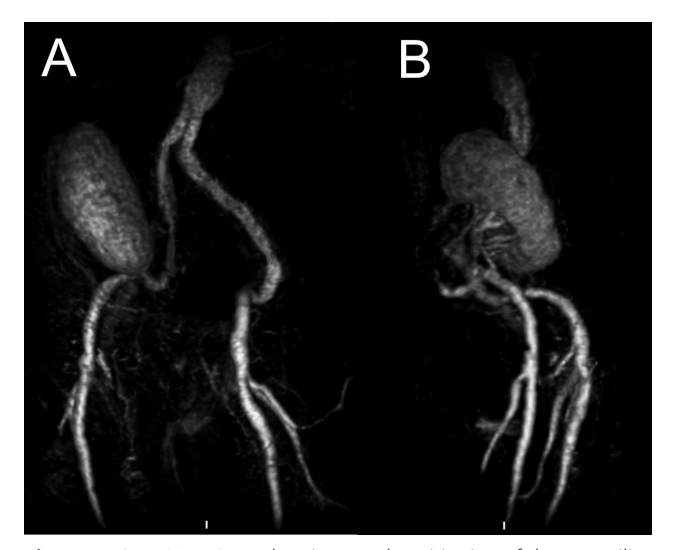
Figure 3 - Post-RT MRI-A, showing good positioning of the aorto-iliac endograft and adequate perfusion of the renal graft.

In order to completely exclude the aneurysm, covering of both hypogastric artery orifices were necessary. There are several description of ancillary procedures to provide flow to hypogastric arteries in EVAR such as surgical bypass<sup>13</sup> or endograft associated with crossover femorofemoral bypass<sup>14</sup>. However, these procedures involve respectively pelvic dissection and use of aorto-mono-iliac endograft, which would harm posterior RT. Thus, we chose covering hypogastric artery bilaterally. As in our case, Zander et al.<sup>15</sup> reported time-limited and insignificant complications with bilateral hypogastric artery occlusion in EVAR. Our patient