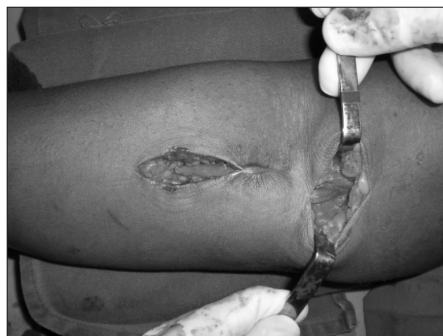
Figure 1. Surgical procedure in patient 1 showing brachiocephalic graft from the greater saphenous vein, and ligation of the brachial artery distally to the arteriovenous anastomosis.

Physiological flow reversal after performing an AVF is common 9 . Symptoms of ischemia are rare and usually relieved by physiologic distal vasodilation 10 . The ischemic symptoms may be caused by the severity of atherosclerotic disease distal to the arteriovenous anastomosis 9 .